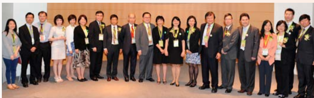
Group photo in the Closing Ceremony