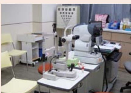
Eye Examination Room