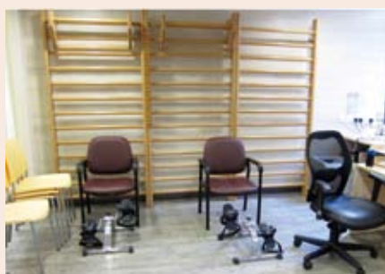
Physical Training Room