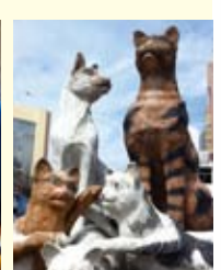
Kuching – cat city The site of this year's WONCA Asia Pacific Regional Conference was Kuching, also known as "Cat City"