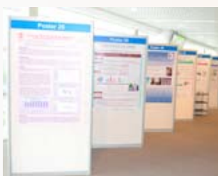
Free Paper Presentation (Poster)