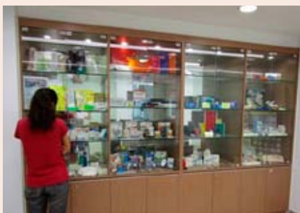
Patient Co-op Shop / Display Corner

Corner could provide a series of updated health information such as self-help BP measurement, BMI monitoring, drug kiosk for drug enquiry, e-health information to achieve self-awareness for health and wellness. The mission and vision in Nurse & Allied Health Clinic is to keep patients "Healthy in the Community".