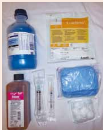
Dressing equipment and syringes

Most of the cases referred to us are trigger digits. Other cases include de Quervain tenosynovitis, tennis elbow, rotator cuff disorder, carpal tunnel syndrome and plantar fasciitis. Methylprednisolone and local anaesthetics, are commonly used for injections. Steroid injection is particularly effective for certain conditions, like trigger digits where the procedure often provides curative treatment. Its effectiveness on treating trigger digits 1 has been proven by randomized controlled trials, and the cure rate is up to 93%. 2 The efficacy of steroid injection for de Quervain disease is controversial. It has been reported to be the most effective treatment for de Quervain disease by a systematic review, 3 although later the Cochrane review found insufficient evidence to evaluate the steroid effect. 4 For some cases, the effect may just be temporary. In carpal tunnel syndrome, as Cochrane review has found that steroid injection shows efficacy for up to 3 months but the long-term efficacy is still unknown. 5 Steroid injection may also reduce pain in plantar fasciitis in one month as shown by a randomized trial. 6