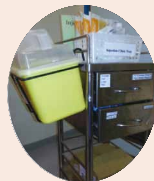
Sharp box and trolley for putting all the equipment used

For cases like tennis elbow, systematic reviews have found that steroid injection provides short term symptomatic relief only, and may even increase pain after 12 weeks. 7,8 Injection is still offered to our patients nonetheless as a treatment option for symptomatic relief as long as our patients understand the possibilities of recurrence, especially if they fail to improve after other treatment options. Short term pain relief can also facilitate physical therapy exercise for patients. Apart from injection, we also give advice on activity modification, including the usage of splint or brace, and arrange referral for strengthening and stretching exercises.