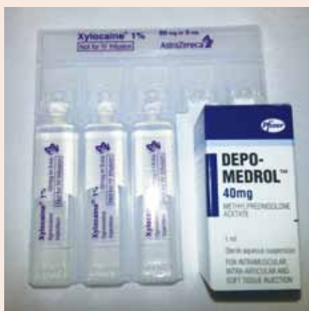
1% xylocaine and methylprednisolone (depo-medrol) 40mg/ml