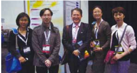
Hong Kong and Beijing delegates of the conference RACGP GP 12

health. This is because in these areas, continuous, comprehensive and coordinated care are of utmost importance. Further training beyond fellowship / membership is also found to be useful and RCGP has "GP with advanced clinical skills." The increasing "measuring, medicalization and marketization" are also noticed. In Hong Kong, this can be reflected in one recent unfortunate medical beauty incident.