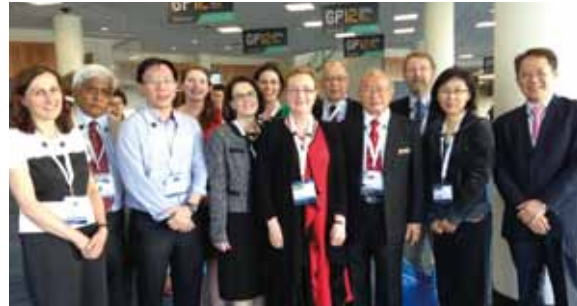
Overseas colleges representatives at RACGP GP 12