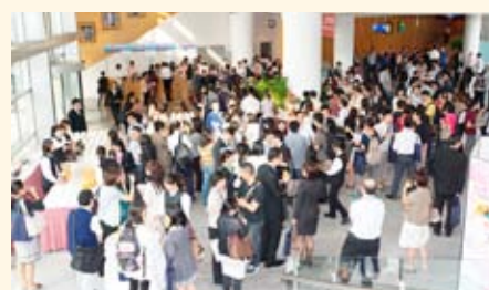
Overwhelming participation in the second Hong Kong Primary Care Conference