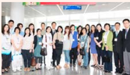
Enthusiastic supporters of Largest Fans Club