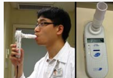
The CO test: the Smokerlyzer