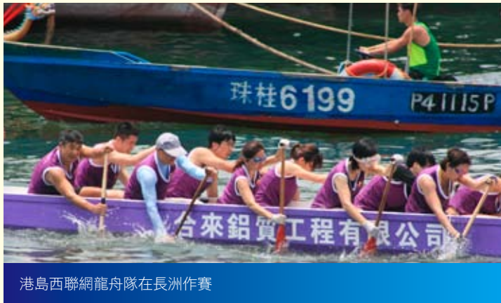
港島西聯網龍舟隊在長洲作賽