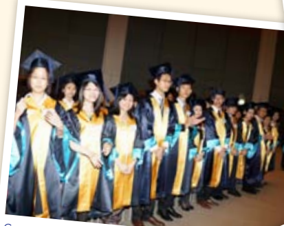
Commencement of Fellowship Conferment