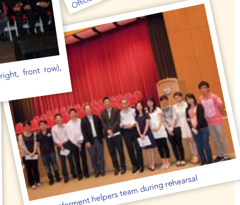
The Conferment helpers team during rehearsal