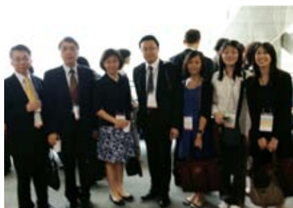
Hong Kong delegates