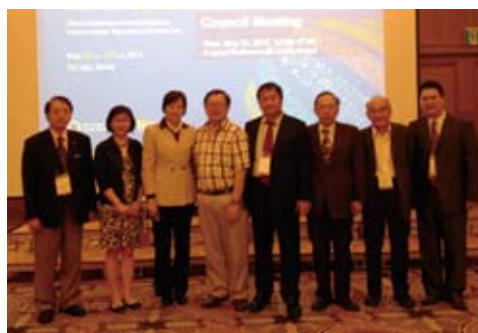
Hong Kong, Shanghai and Taipei delegates