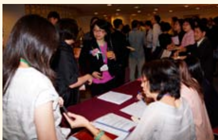
Overwhelming participation in the Symposia