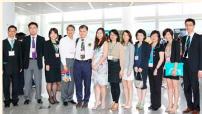
Organizing Committee Members

With your support, I am confident that the annual HKPCC will continue to be at the forefront of health care events for family physicians and primary health care professionals!!