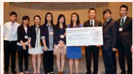
Winning Team of Clinical Case Presentation Competition and staff.