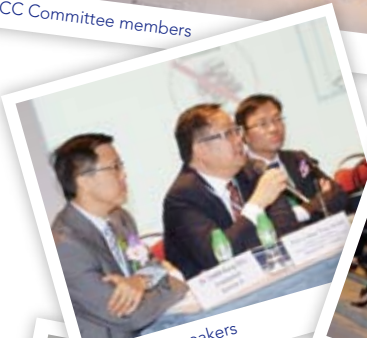
Seminar A speakers