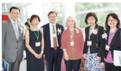
HKPCC guests and VIPs