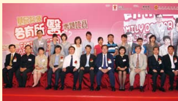
Prize Winners and Officiating Guests.