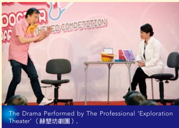
The Drama Performed by The Professional ‘Exploration Theater’ (赫墾坊劇團).