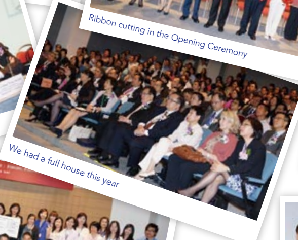
We had a full house this year