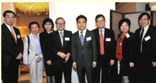
Multi-specialty Medical Mega Conference