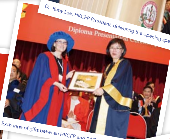
Exchange of gifts between HKCFP and RACGP