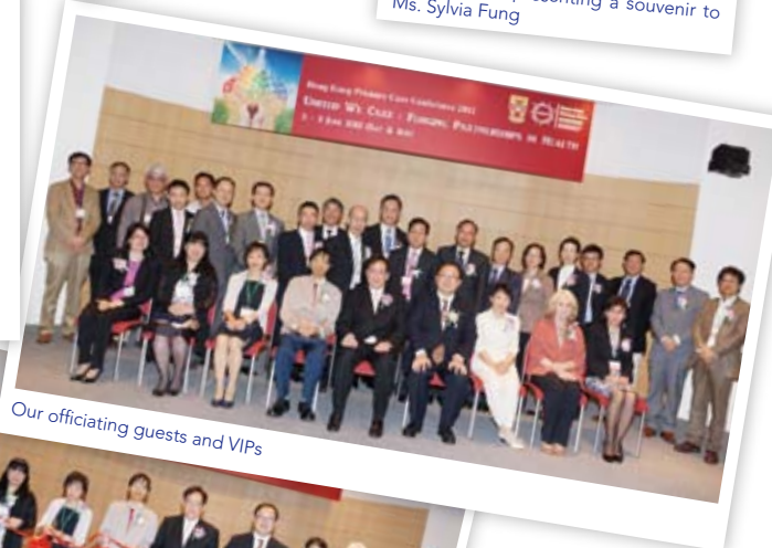
Our officiating guests and VIPs