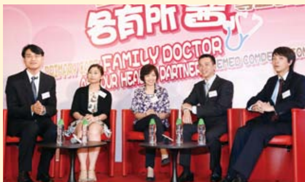
Public Education Committee Members on the Stage for the Health Forum with the Chinese Title of 「那些年，我們一起看過的家庭醫生」.