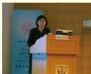
Introduction of HKCFP QA Programme at The College of Dental Surgeons 2012 Spring Scientific Meeting

The official opening ceremony of RCHK took place on 26 th May 2012 at the St. John Ambulance Building with Dr. the Hon York Chow, Secretary for Food and Health, as the Guest of Honour.