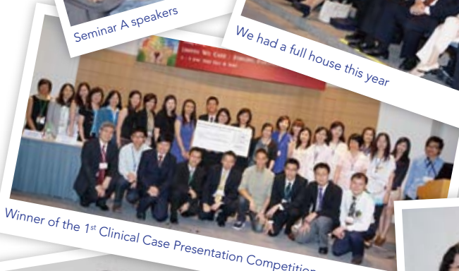
Winner of the 1st Clinical Case Presentation Competition