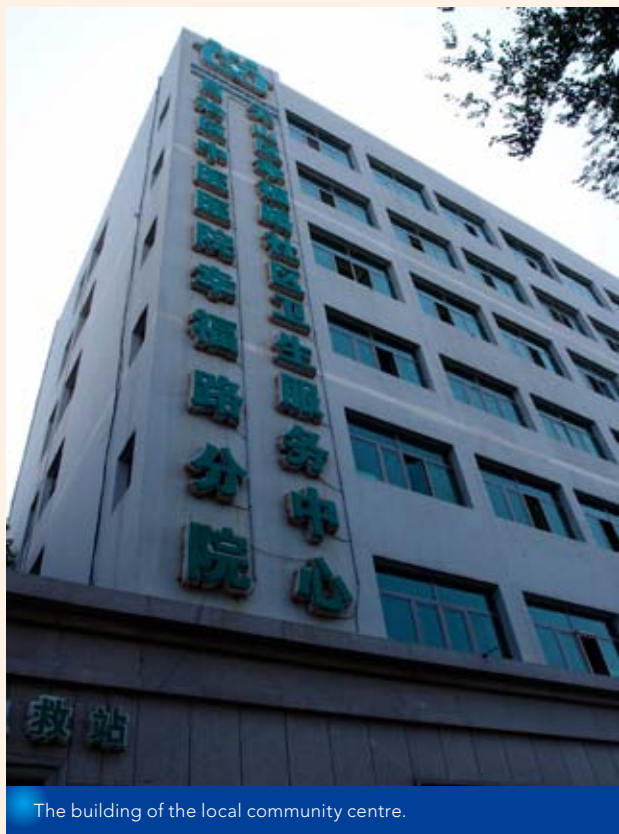
The building of the local community centre.