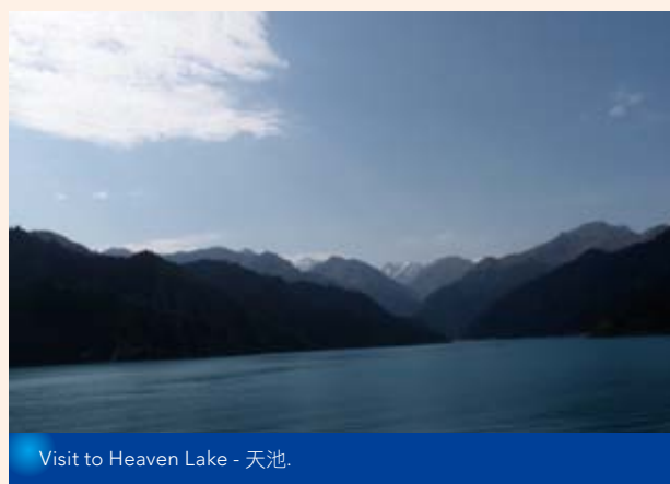
Visit to Heaven Lake - 天池.

I'll be sharing more of my ideas on how our community health centres could be run in a second article.