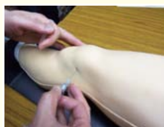
Orthopaedic Injection Workshop