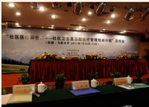
The meeting hall at the conference at Urumqi (新疆烏魯木齊).

For the past three years, the Hospital Authority of Hong Kong has been organizing primary care training programmes for health policy administrators and frontline primary doctors from the Mainland. The programme was funded by Dr. Cheng Yu Tung Foundation in support of China's recent healthcare reform. The conference at Urumqi not only reviewed the changes that had been implemented as a result of the training programme, but also served as a platform to generate ideas for future primary care development in China.