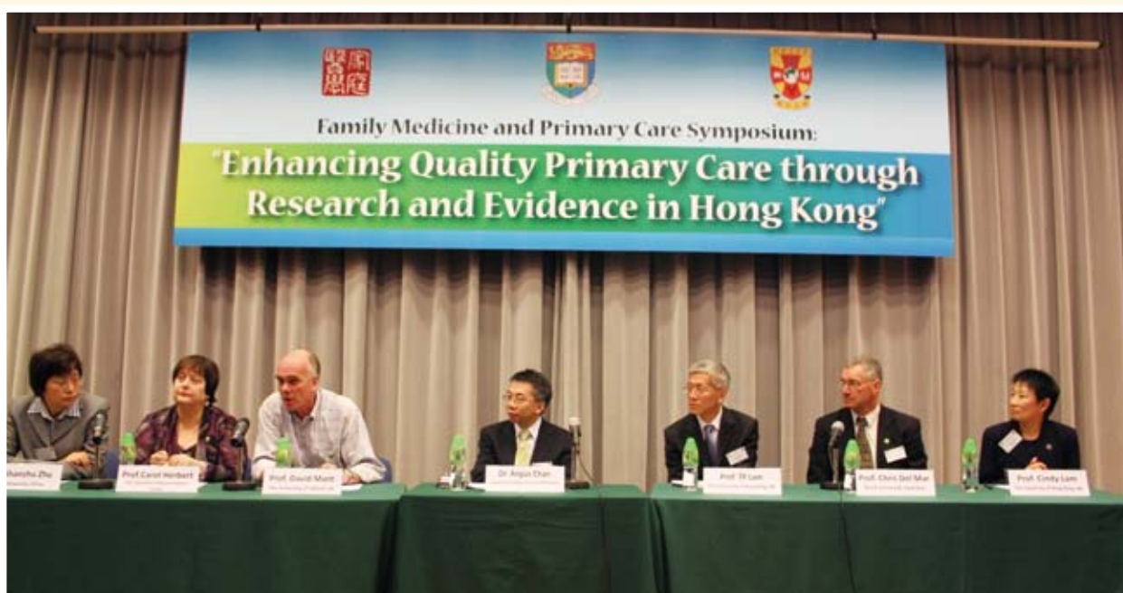
International speakers responded to questions from participants during the Forum: "Integrating Evidence and Practice"

More symposium details are available at http://www.fmpc.hku.hk/index.php .