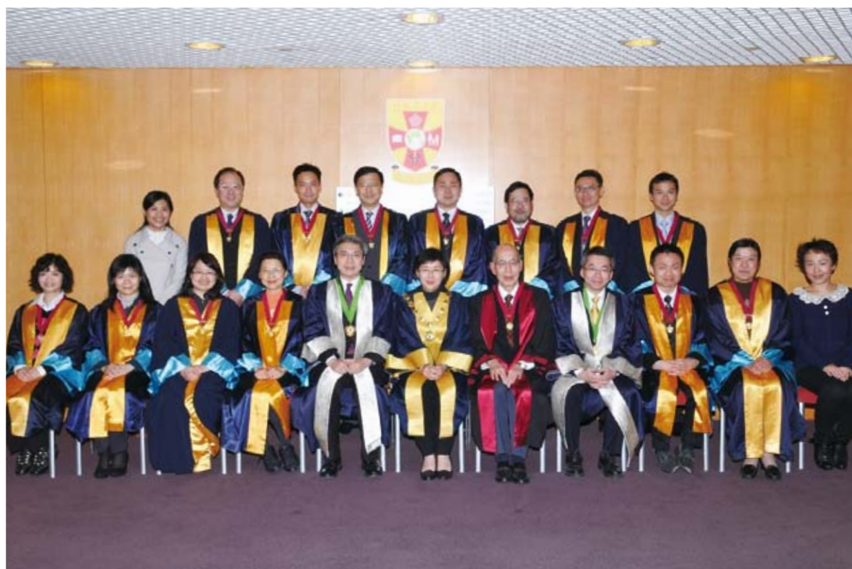
Group photo of HKCFP Council 2011 – 2012