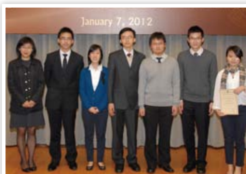
Faculty Prize Presentation Ceremony on 7 th January 2012

2012 and presented the Hong Kong College of Family Physicians' Prize in Community Medicine to the student awardees.