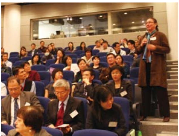
Participants actively engaging in the discussion with the international and local speakers

extent to which health services research, clinical research and basic science research integrate