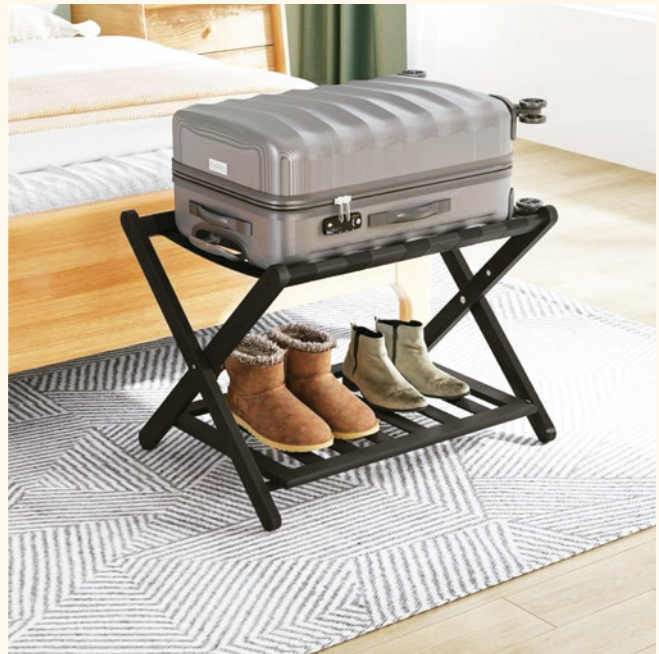
Placing items on a luggage rack may be a way to ward off bed bugs during travels

In summary, bed bugs are small insects that feed