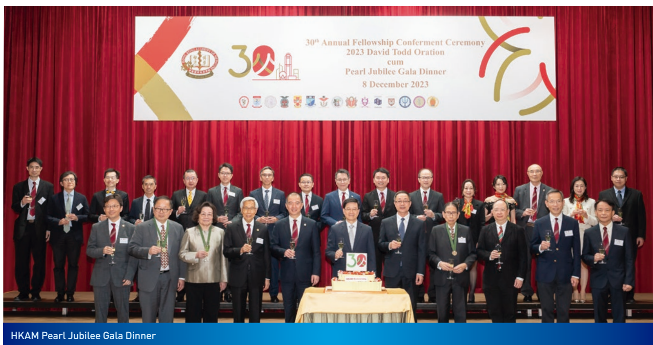
HKAM Pearl Jubilee Gala Dinner