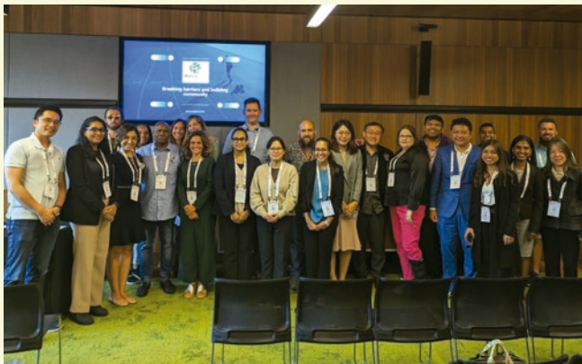
Participants of YDM workshop (breaking barriers and building community)