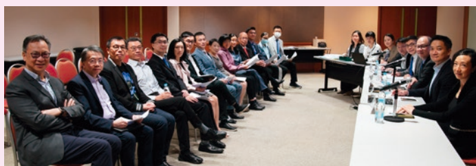
Photo of the floor Fellows and Members attending the Annual General Meetings.

The Composition of the Council 2023 – 2024 is as follows: