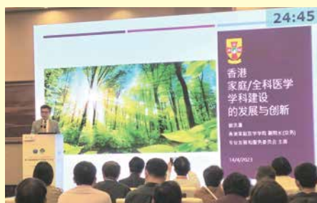
HKCFP delegates sharing experience about trainings and works in Hong Kong.