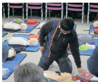
APCLS Training Workshop

*Course syllabus and schedule may be subject to change without prior notification