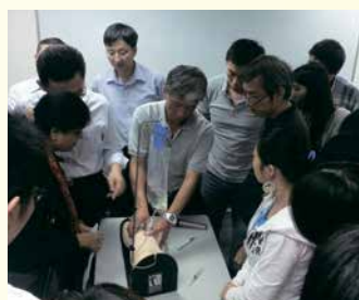
Orthopaedic Injection Workshop