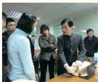
Women's Health Workshop