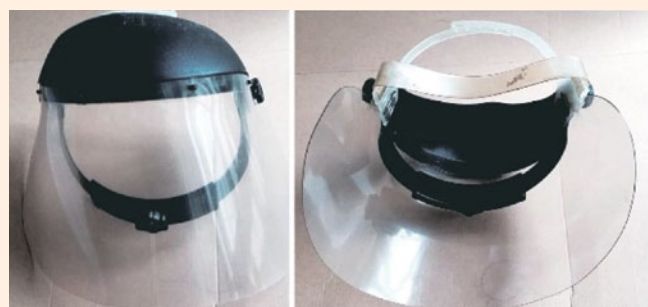
Fig 2 (Industrial face shield)