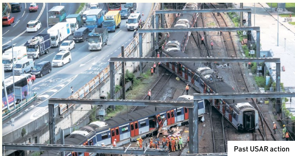
Past USAR action

A non-passenger-carrying MTR train, during the testing of a signalling system, collided with another non-passenger-carrying train on the railway track between Central Station and Admiralty Station. Train compartments were damaged and derailed. The FSD mobilised 13 fire appliances and two ambulances to assist the two train captains to get out of the train compartments before conveying them to hospital for medical treatment. In order to restore train services to normal as soon as possible and to minimise the impact on the lives of the public, the FSD dispatched seven fire appliances and the USAR Team to assist in handling the incident on the following day. Fire personnel lifted the derailed train compartments with the aid of heavy duty hydraulic jacks and airlifting bags, making it possible for the train to be put back on track and be removed from the scene.