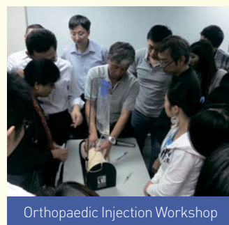
Orthopaedic Injection Workshop