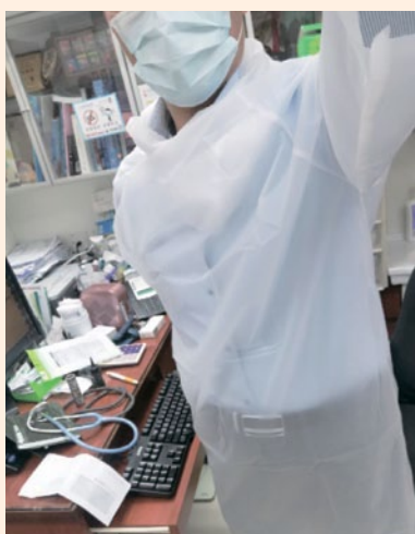
Fig 1 (raincoat as protective gown)

Finding sufficient personal protection was very difficult, as we all citizens should remember. Masks, face shields were all lacking. Fortunately some general practitioner colleagues did teach me some ingenious ideas on wearing raincoats, using industrial goggles/ face masks for protection. (Fig.1, Fig. 2)