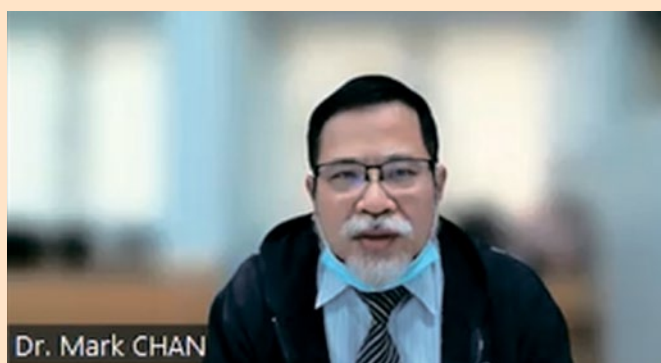
A screenshot taken on 4 February 2023