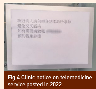
Fig.4 Clinic notice on telemedicine service posted in 2022.

How about our patients? Providing telemedicine to the infected cases have been studied for quite a while in my clinic, the heavy pandemic burden has accelerated the commencement of service to the needed. This service started without any IT support, without concrete guidance/advices from any health authority, by using WhatsApp platform (Fig. 4). I was indebted to those colleagues who shared their experiences on the logistics of conducting teleconsultation to me. The need was certainly there as patients from different districts were phoning for our services especially when the Designated Clinic services were quite overloaded later on.