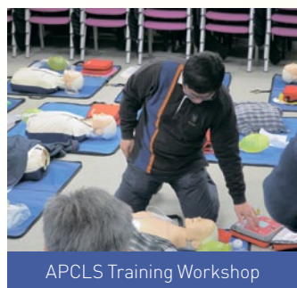
APCLS Training Workshop

*Course syllabus and schedule may be subject to change without prior notification