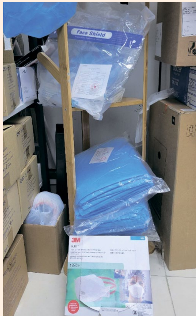
Fig.3 (Personal Protective Equipment)

While some GP colleagues, for various personal reasons chose to close their clinics temporarily, maintaining services were important. My friends and I who strove hard to maintain our services, did face tough times when clinic nurses were sick or quarantined as close contacts... Luckily I was able to find some part-time clinic nurses to help out when my own nurses, in turn, were unable to be on duty. In the 5 th wave, we also face shortages of drugs. We tried hard not to get sick too. In those times, I started wearing the high level N95 masks and full PPE with disposable gowns, and face shields. (Fig. 3)