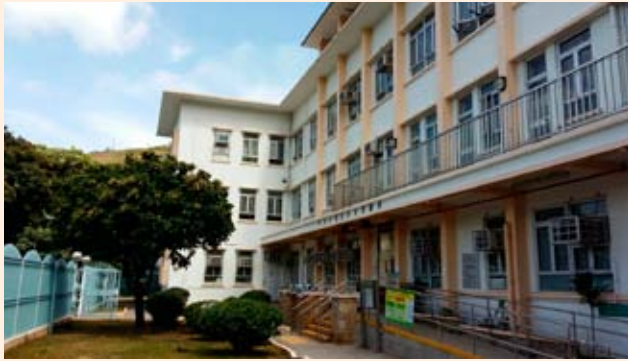
Tai O GOPC

Surrounded by wetlands and mangrove habitats, Tai O Jockey Club General Out-patient Clinic (GOPC) has been serving the population of the quaint stilted village for over half a century.