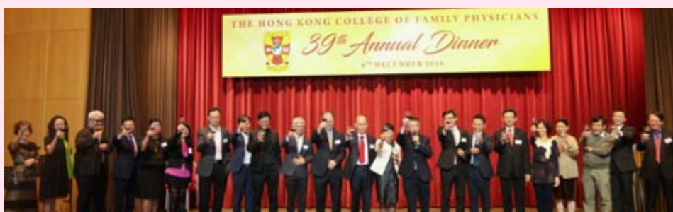
Toasting proposed by President, with Council Members