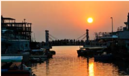
Sunset of Tai O