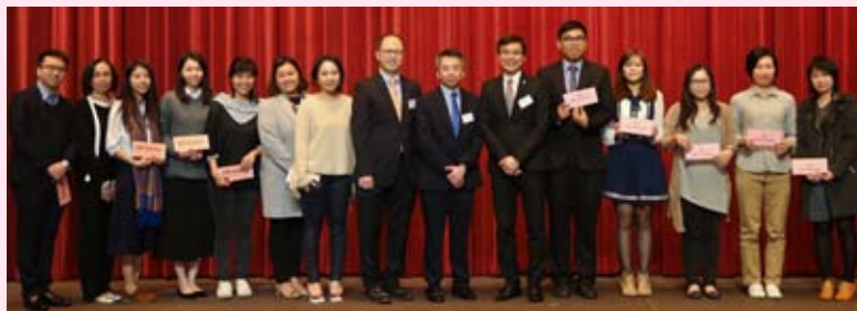
Executives thanking our College staff for their hard work over the year