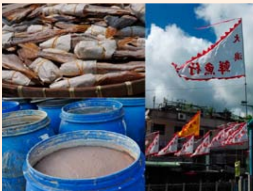
Shrimp paste and salty fish everywhere