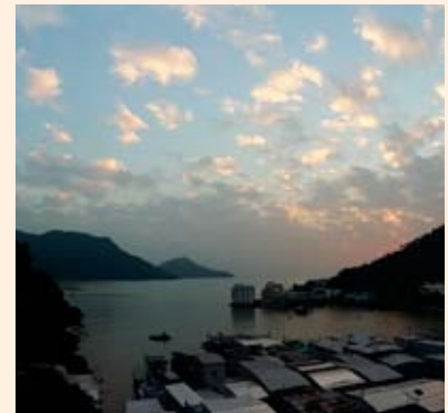
View from the clinic roof