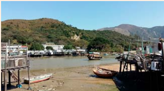
Tai O GOPC and the surroundings

Lying off the southwest coast of Lantau Island, Tai O is a unique historical fishing village in Hong Kong. It was inhabited mainly by the Tanka people. As far back as the Sung Dynasty, the salt production and fishing industry were well scaled. It was once the main spot of sea fish supply in Hong Kong.