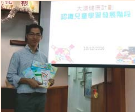
Collaboration with community organizations for health education

In addition to the emergency services described, the pivotal role of the GOPC as the only medical provider of Tai O is to take care of the local