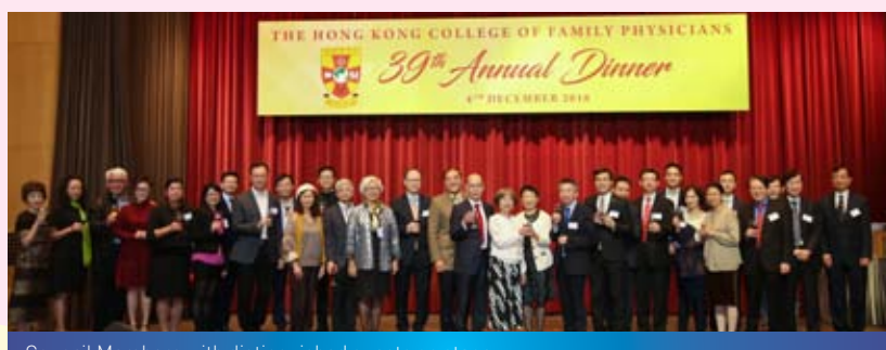
Council Members with distinguished guests on stage