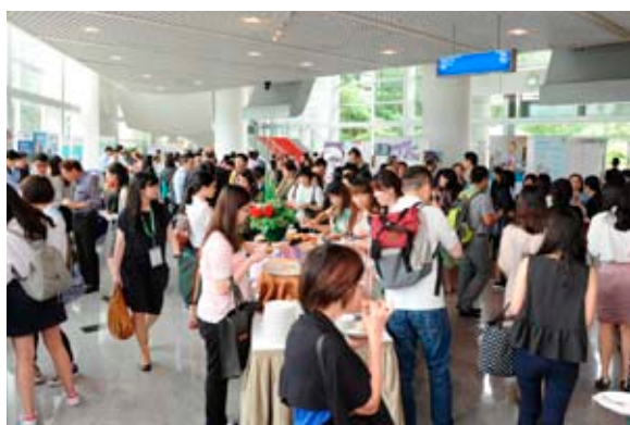
Conference delegates during coffee break