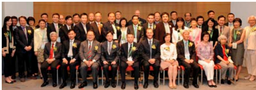
Group Photo of invited guests