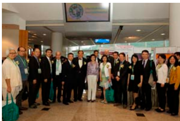
Group photo of invited guests before opening ceremony