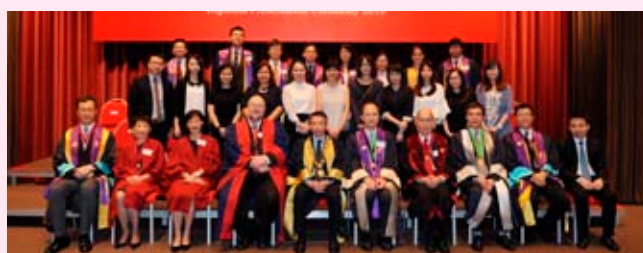
Council members, platform guests, and helpers taking a group photo with the secretariat staff