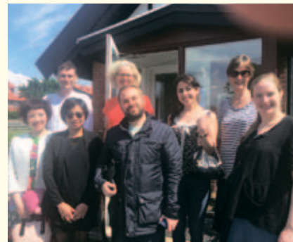
Family doctors from Denmark, Sweden, Italy, UK, New Zealand and Hong Kong met in a Danish GP clinic.

GPs in Denmark are very important because they serve the role of gate-keeper. They are empowered to do so as patients must have GP referral before they can see hospital specialists or allied health care providers such as physiotherapists. The principle of continuity of care can also be practiced well as patients are assigned by the regional health authority to be under the care of a private GP clinic. If they would like to change their GP, they have to apply and obtain approval from the authority first.