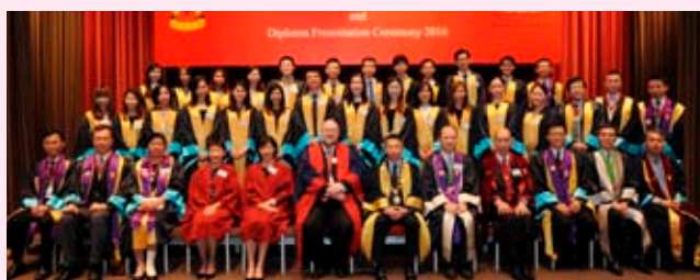
Council members and platform guests taking a group photo with new HKCFP / RACGP Fellows