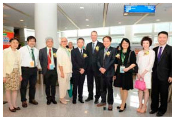
Group photo of invited guests before opening ceremony