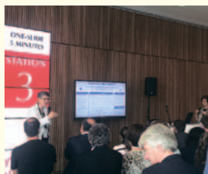
The "One-slide-5-minutes" stations in the conference lobby were very popular.

Apart from the traditional oral and poster presentations, the "one-slide-5-minutes" presentations and the 3 clinical skills labs, namely a microbiology skills lab, a gynaecology skills lab and a clinical ultrasound skills lab, located in the conference lobby were very popular, creating an enthusiastic learning and experience exchange environment for all the conference delegates.