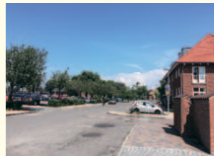
The Danish GP clinic takes care of a population of 3700 in a peaceful town close to Copenhagen city.

It is well recognized that Danish General Practice is one of the most well-functioning in the world. With a well-planned and well-regulated health policy respecting the importance of general practice in Denmark, work life balance of GPs is no longer only a slogan or a never reaching goal. I wish that not long in the future, GPs from other parts of the world can also be acknowledged and received similar respect from regional health regulatory bodies and public, just like the Danish GPs who can be well-equipped and well-facilitated to practice medicine with heads and hearts.