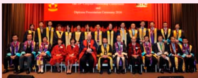
Council members and platform guests taking a group photo with DFM diplomats