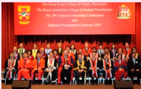
Group photo of platform guests on stage