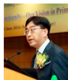
Dr. Ko Wing Man, BBS, JP, giving his speech