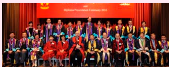
Council members and platform guests taking a group photo with successful Exit Examination candidates