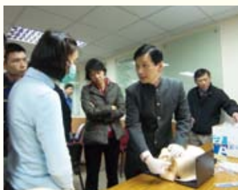
Women's Health Workshop