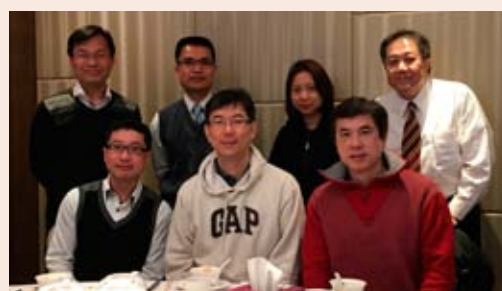
The Younger Generation