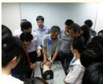
Orthopaedic Injection Workshop