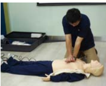
CPR Training Workshop

*Course syllabus and schedule may be subject to change without prior notification