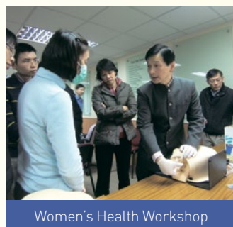
Women's Health Workshop