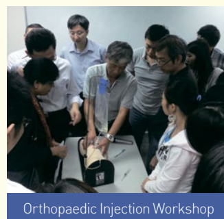
Orthopaedic Injection Workshop