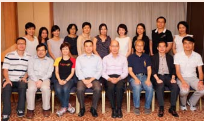
二〇一四年七月公共教育委員會同工聚會合照

陳： 記得那年的 Council 競選激烈，十一人競逐六個議席。當選後深深體會到選票的力量，推動我要積極參與會議，不可辜負選民的期望，同時成為 Council member 後視野也擴闊了。