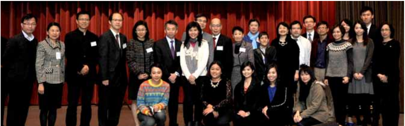
Council members and staff