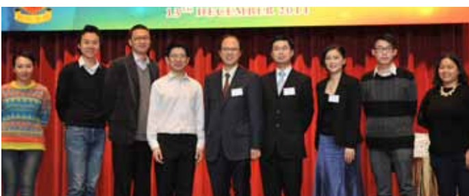
Members and staff of the Internal Affairs Committee and Photography Club