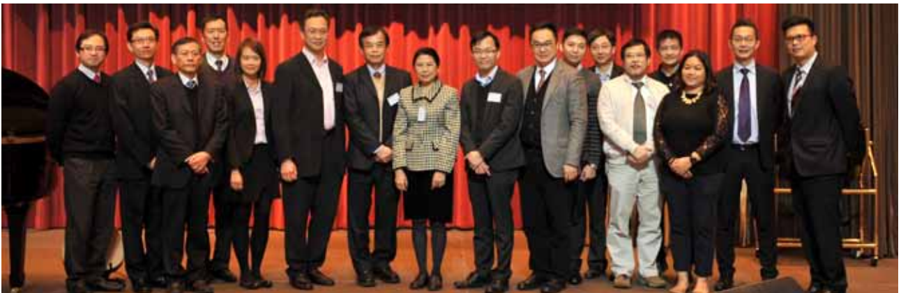
Group photo of pharmaceutical companies' representatives, distinguished guest and members of the Board of Education