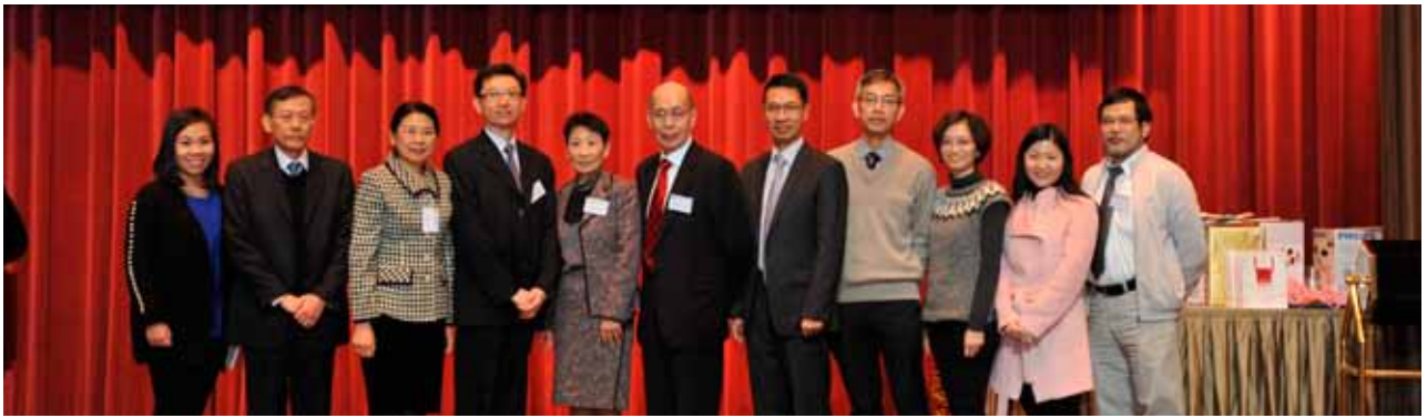
Group photo of Diploma in Family Medicine successful candidates with members of the Board of Diploma in Family Medicine