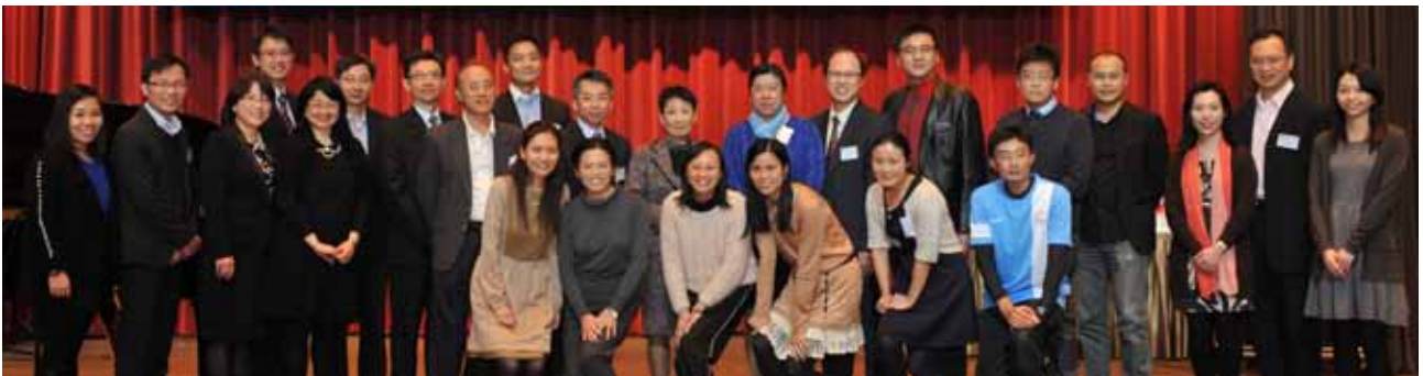
Group photo of Exit Examination successful candidates with examiners and members of the Specialty Board