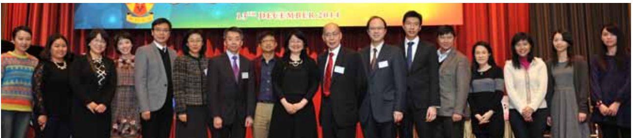
Members and staff of the Hong Kong Primary Care Conference Organising Committee