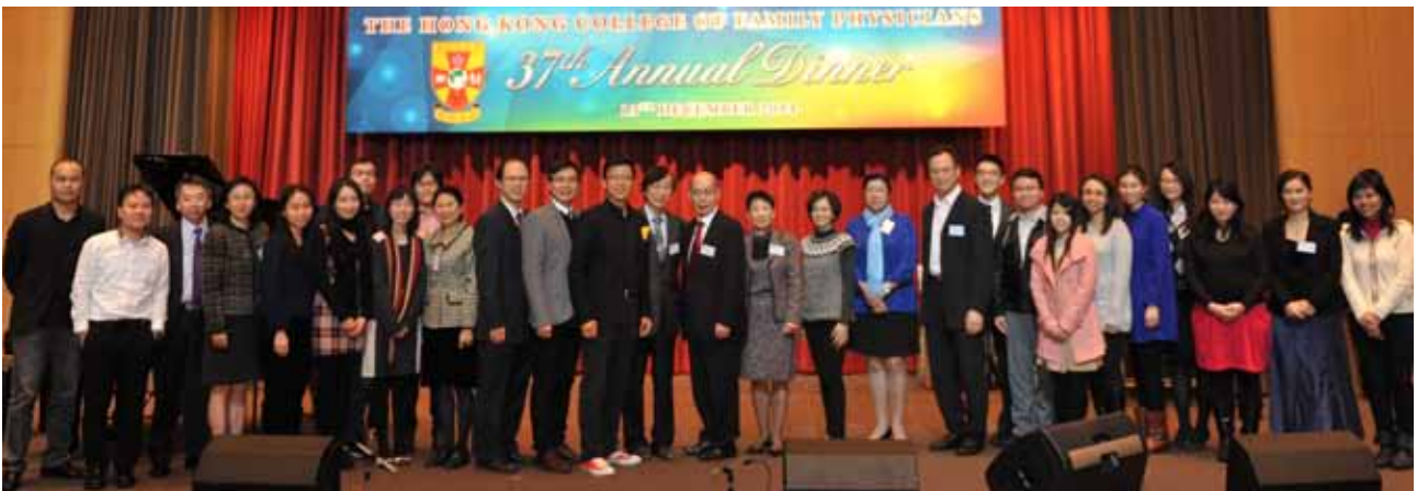
Group photo of Conjoint Examination successful candidates with members of the Board of Conjoint Examination