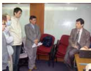
Women's Health Workshop