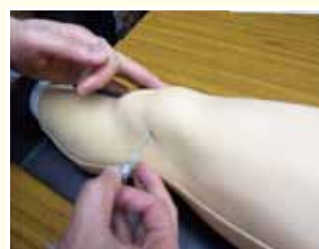
Orthopaedic Injection Workshop