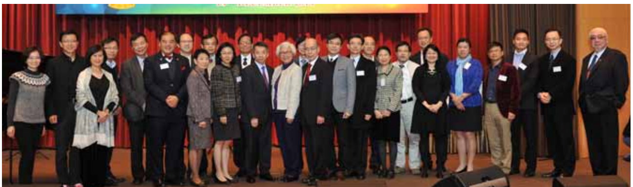
Council Members with distinguished guests