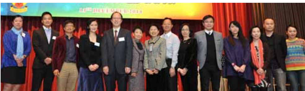
Members and staff of the Editorial Board