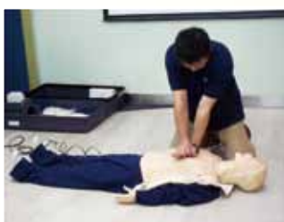
CPR Training Workshop

#Cantonese and English will be used as the language for teaching and examination.