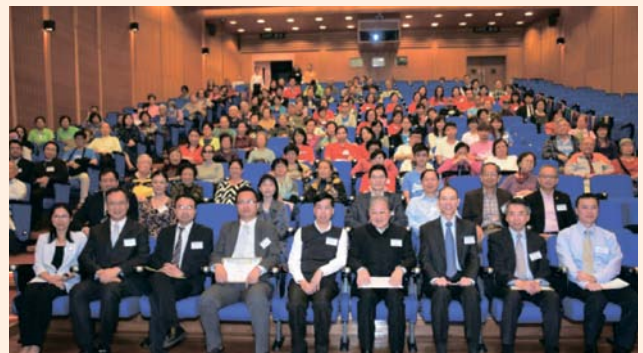
「與慢性疾病同行—心血管疾病」健康講座