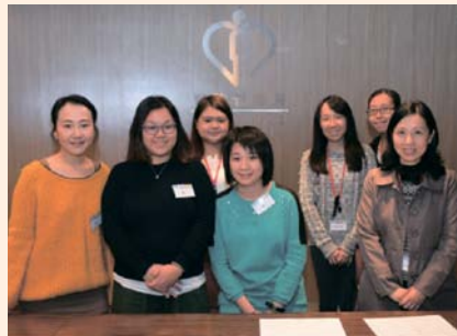
香港家庭醫學學院秘書及九龍中聯網家庭醫學及普通科門診部秘書