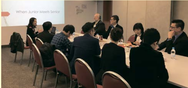
We are at the meeting.