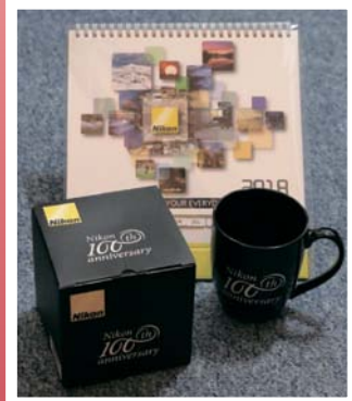
Nikon 100 th Anniversary souvenirs.