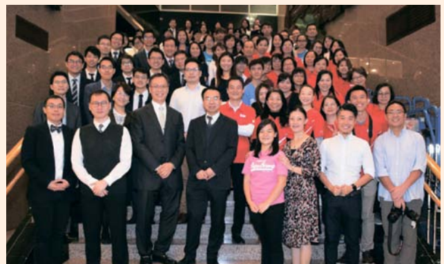
「共創健康社區2017」大合照