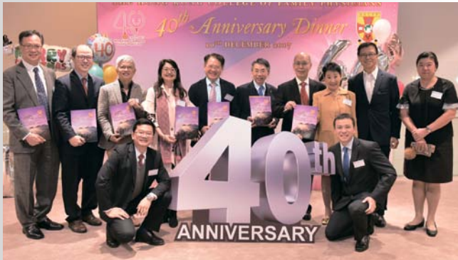
Censors and Council members proudly present the 40 th Anniversary publication which was first distributed on 10 December 2017.