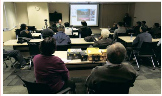
HKCFP photobugs in the middle of the lecture.