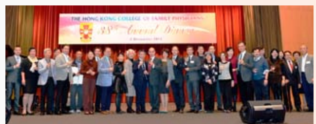
Council Members with distinguished guests