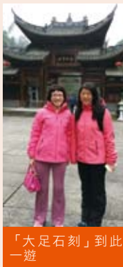
「大足石刻」到此一遊