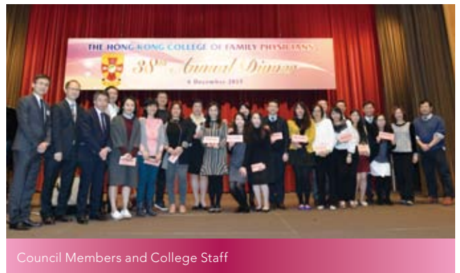
Council Members and College Staff