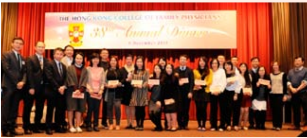
Council members thanking our College staff for their hard work over the year